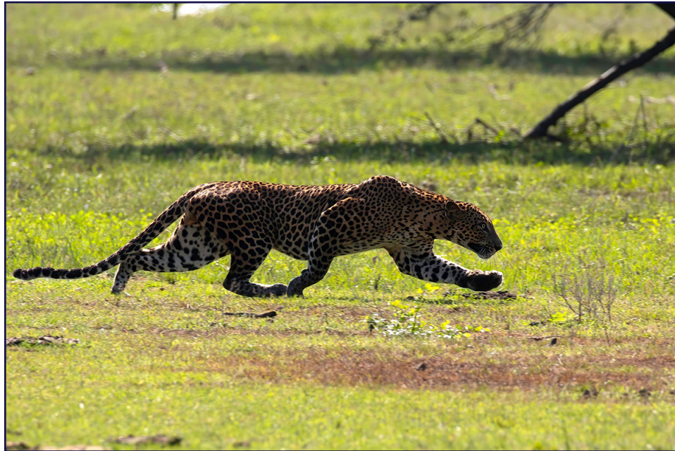
Sri Lankan Leopard