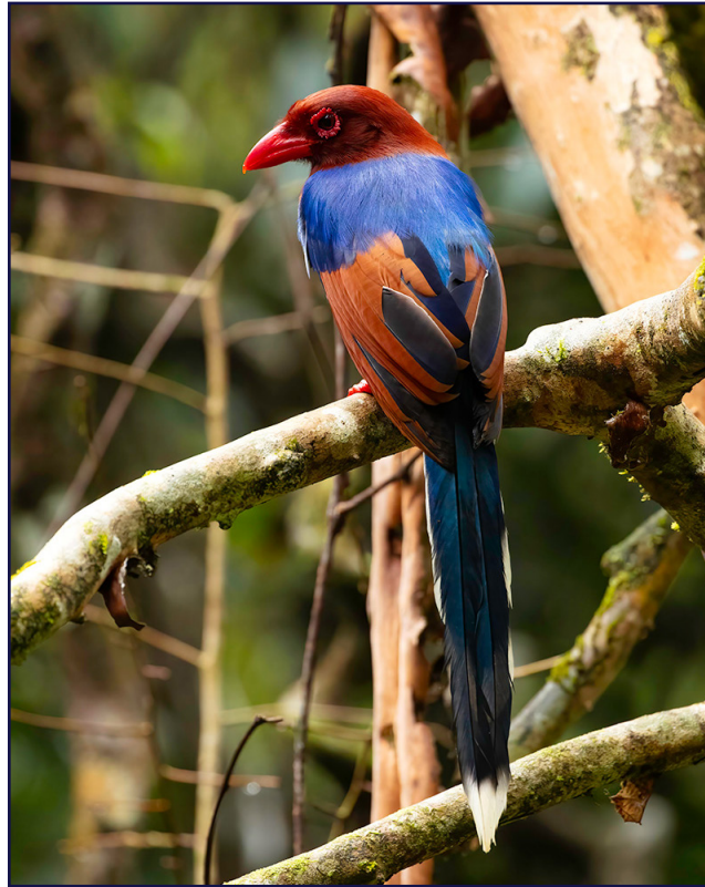
Sri Lanka Blue-Magpie