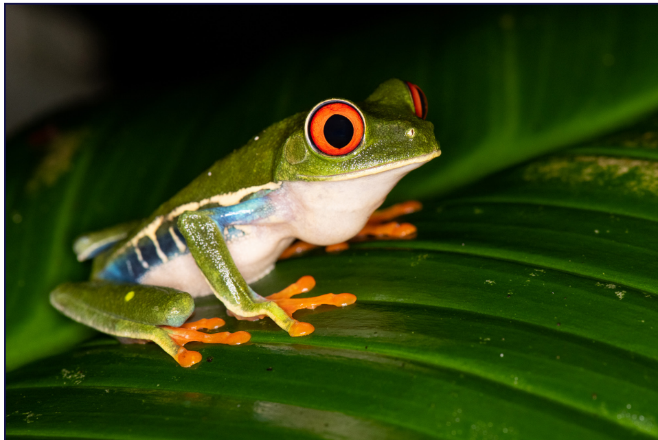
Red-eyed Tree Frog

Overnight: Arenal History Inn or Similar