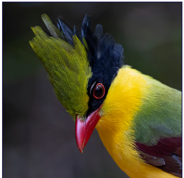
Indochinese Green Magpie